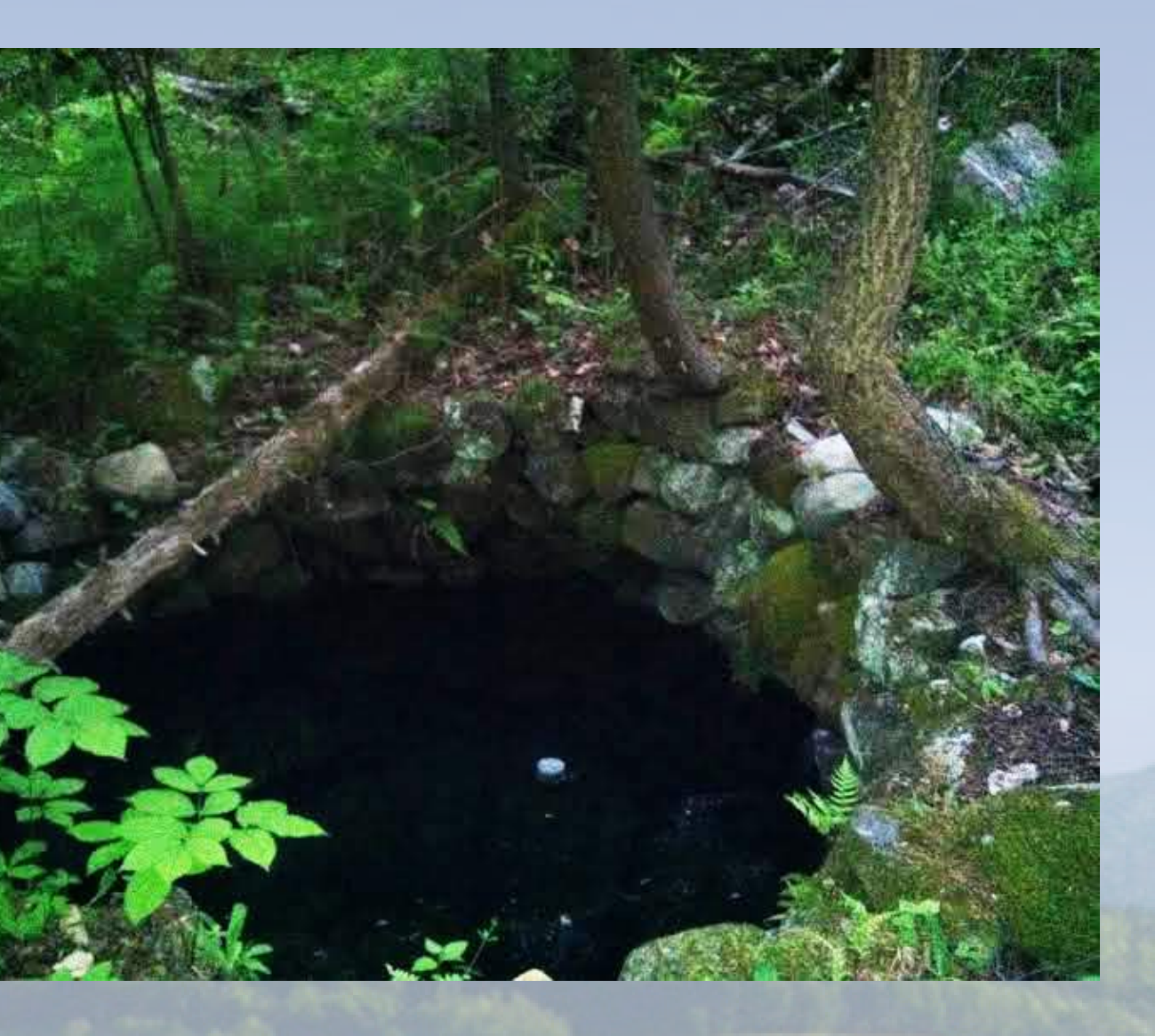
Image References: USGS Topological Maps, Google Earth, Google Map, James Graves

The elevated springs were found to provide little power and energy, totaling only 4.8% of average annual energy demand at a levelized cost of $0.24/kWh. The in-stream turbine was restricted by the slow flow velocity and the shallowness of the river resulting in little potential of being a stepping stone toward self sufficiency. The exact quantity of extractable power was found to be dependent upon the turbine model. Utilizing a diverged spillway showed a potential to supply up to 3500kWh per month, at a levelized cost of $0.12/kWh. This is larger than the estimated average monthly energy usage of electricity and propane totaling approximately 3000kWh. Electricity is $0.11/kWh, inferring that hydropower is not a feasible option.