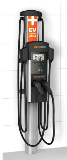
Figure 2. ChargePoint CT4000 (Dual Connector)